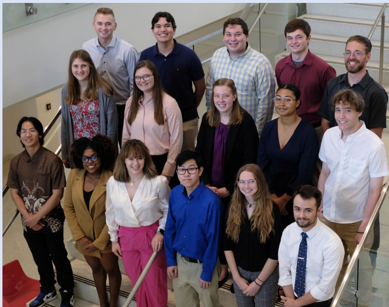
The Summer 2022 REU Cohort

Applications for Summer 2023 begin November 1, 2022