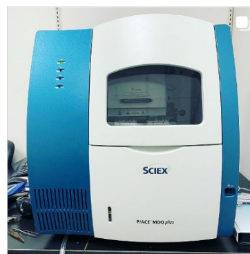
Figure showing the principle of capillary electrophoresis (CE) and an instrument used to perform CE

Skills that will be gained include cell culture; protein expression and purification; operation of a capillary electrophoresis instrument; safe, ethical, and well-documented laboratory practices; troubleshooting; working collaboratively; and communicating with expert and lay audiences.